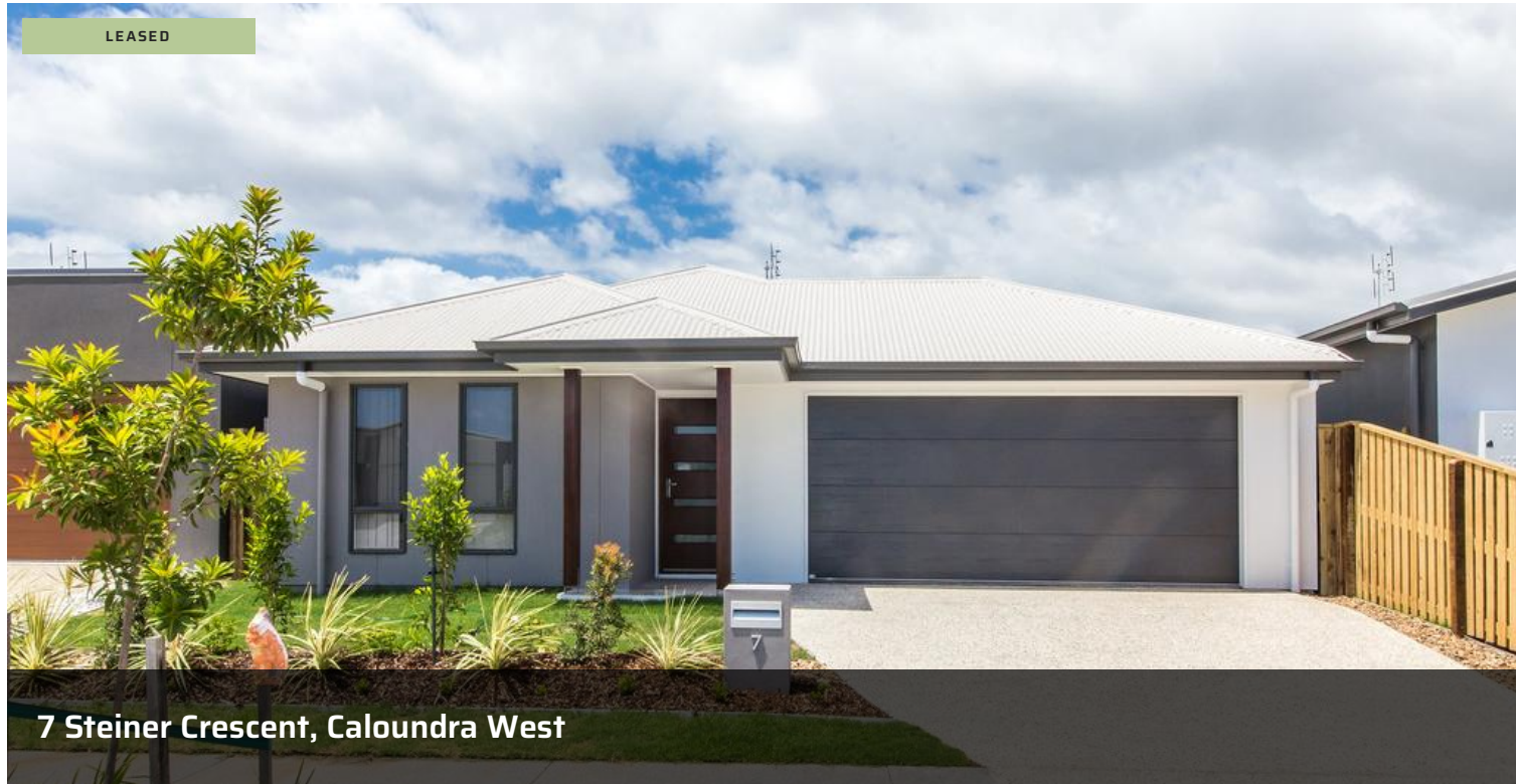
7 Steiner Crescent, Caloundra West