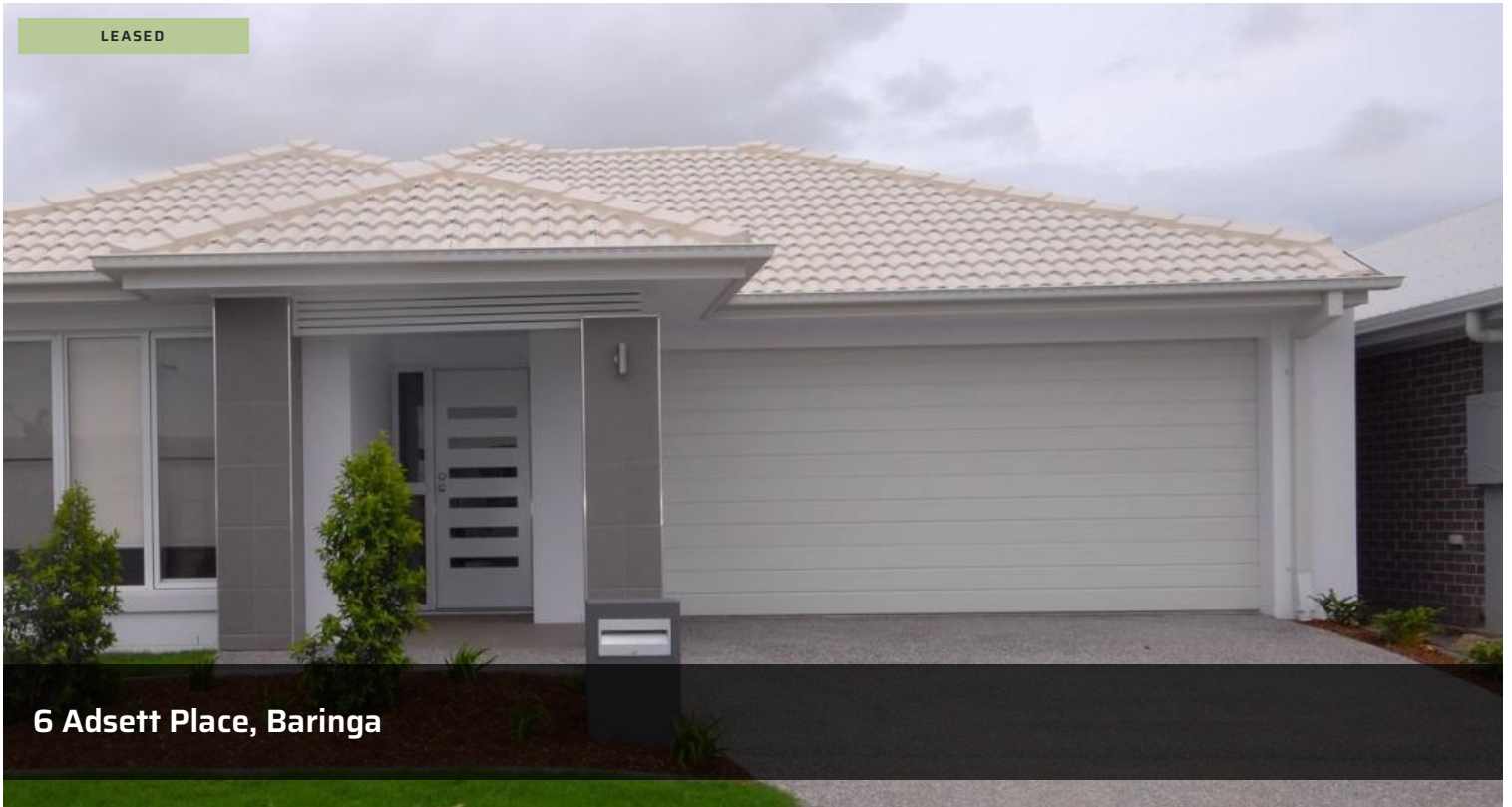
6 Adsett Place, Baringa