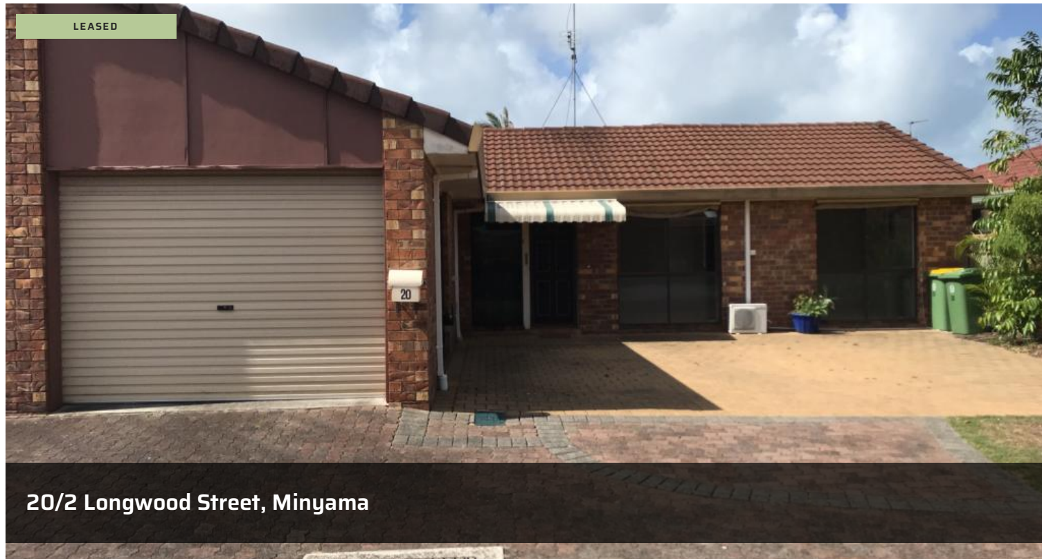
20/2 Longwood Street, Minyama