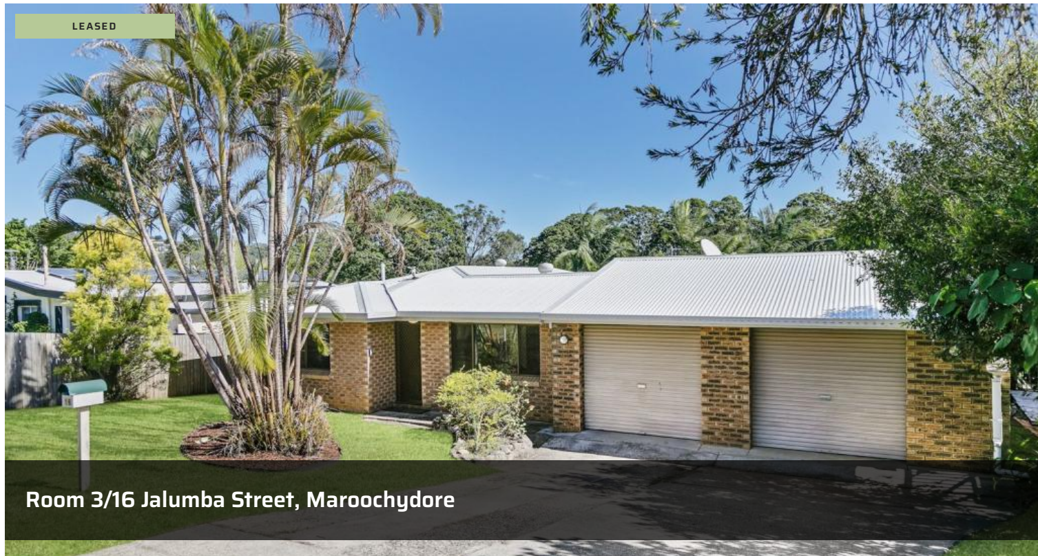
Room 3/16 Jalumba Street, Maroochydore