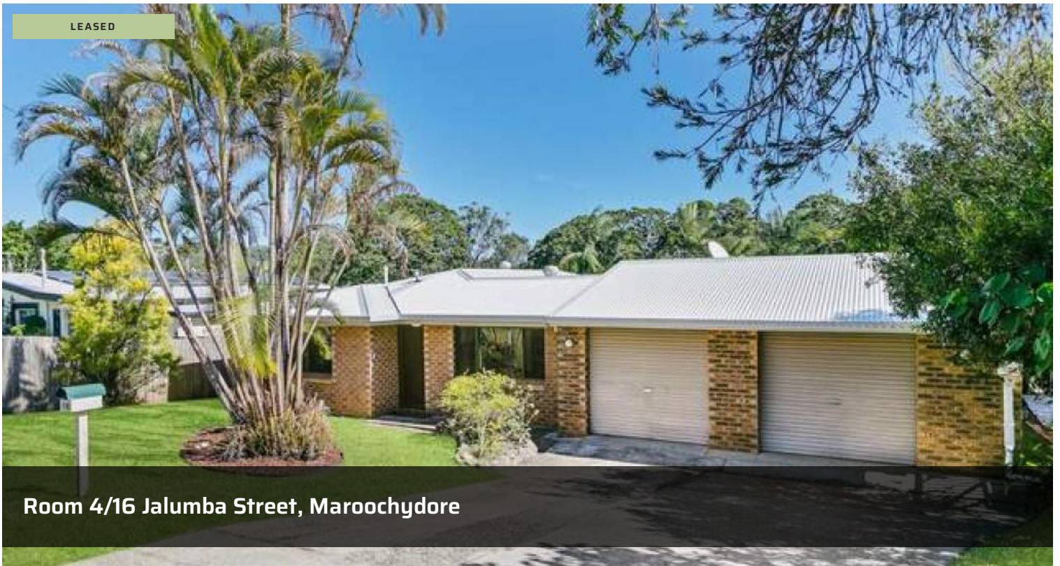
Room 4/16 Jalumba Street, Maroochydore