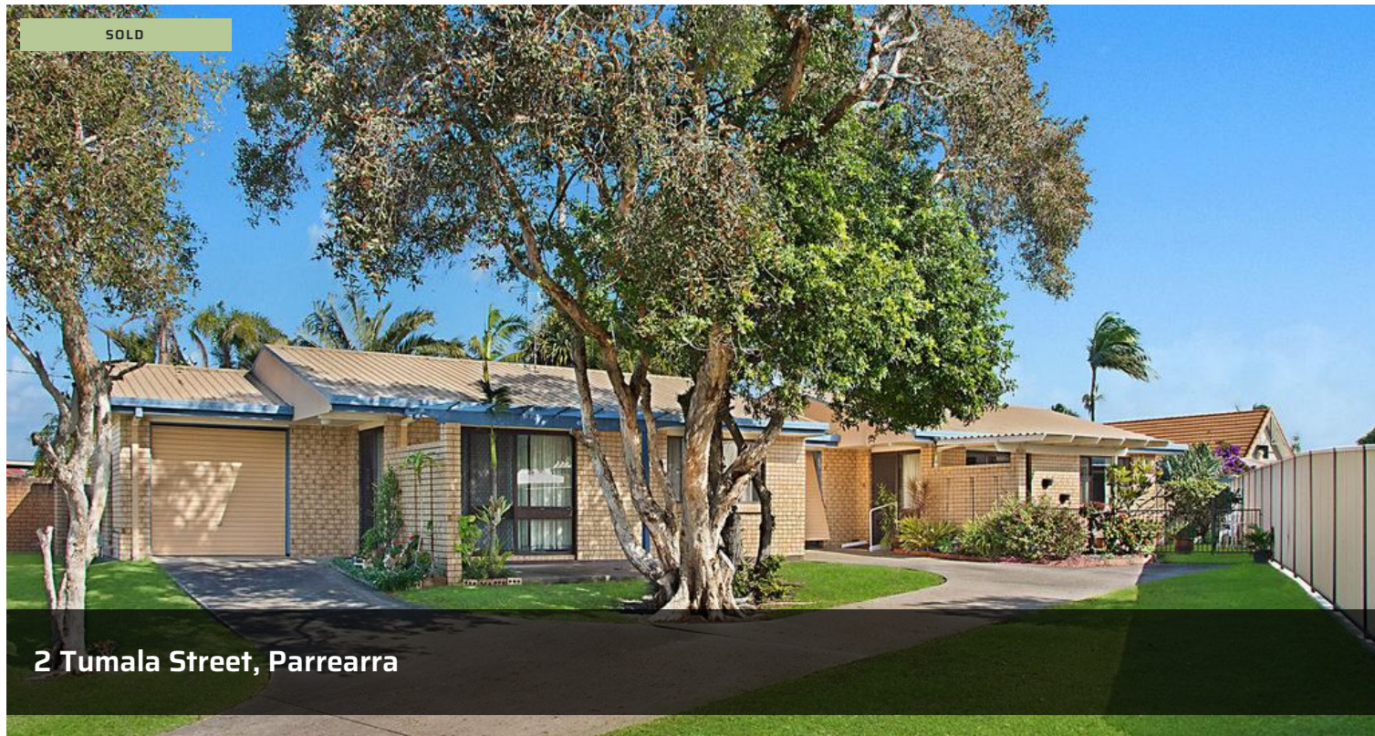
2 Tumala Street, Parrearra